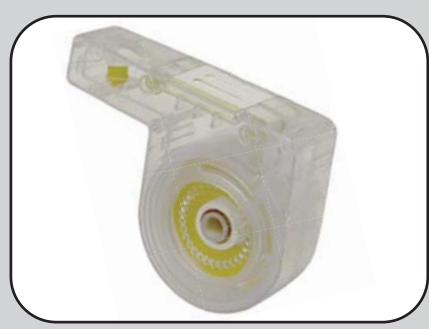
Eco-friendly and low cost double sides reel cleaning design