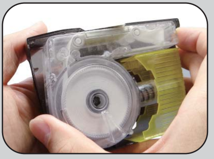
Easy to remove cleaning reel without cause any contamination