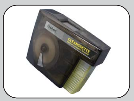
CLEANSSETTE-Optical connector cleaner in cassette design