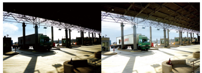
Without WDR Pro